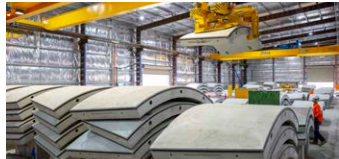
Inside the Marrickville precast facility.

Sydney Metro is working with Transport for NSW to provide access to the precast facilities. Transport for NSW will construct a new section of Archbold Road from Lenore Drive, and an access road between the southern and northern facilities. This work is subject to assessment and determination by Transport for NSW. These road works would be planned to coincide with the precast facility construction works. Further extensions to Archbold Road would be completed at a later stage.