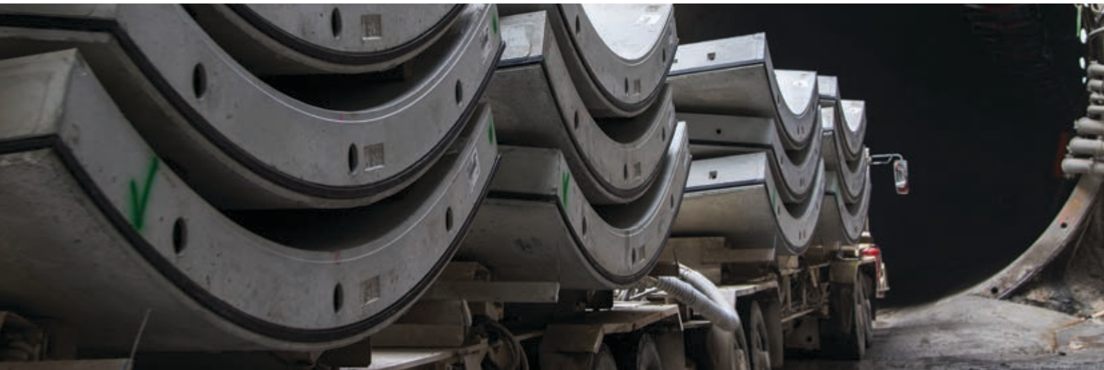
Precast segments used for the Sydney Metro City & Southwest project.